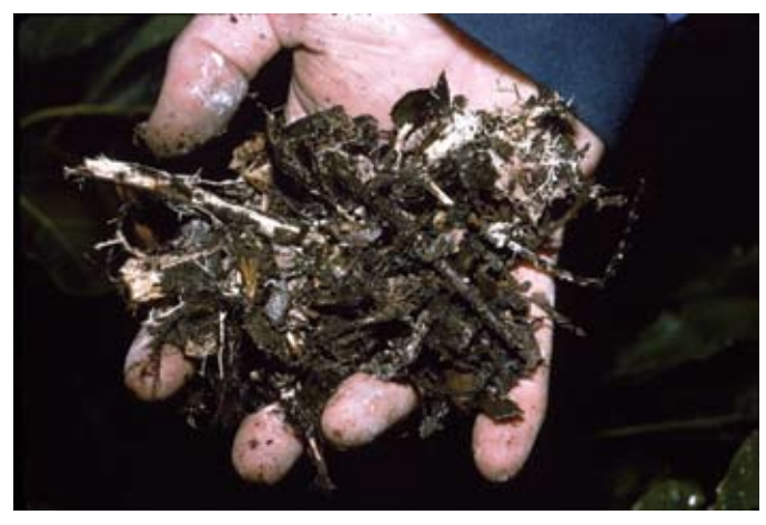
Figure 3. Fungi grow through mulch with mycelium and rhizomorphs that secrete enzymes (cellulases) which have been shown to control root diseases.

A coarse mulch layer cuts evaporative water loss from soils thus preserving moisture for root absorption. This source of moisture is especially useful to shallow rooted trees such as avocado. I have found in various studies that mulched trees can skip every other irrigation compared to non-mulched trees and maintain the same soil matric potential (Downer, 1998; Downer and Hodel, 2001; Downer and Faber, 2005). The caveat here is that the mulch must be coarser than the underlying soil. Mulches texturally finer than the soil underneath them can lead to increased moisture loss and drying (Svenson and Witte, 1989). Moisture savings by mulches is greatest when there is maximum exposure of soil to the sun, before