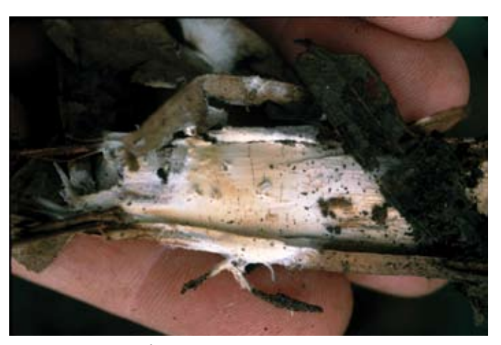
Figure 4. Ceraciomyces tessulatus is a potent cellulase producer. The fruiting body looks like paint on the wood surface it is decaying.

Mulching has been associated with root rot disease control for many years and was notably documented by Broadbent and Baker in Australia back in 1974. They observed that mulched avocado orchards could become suppressive to the avocado root rot organism Phytophthora cinnamomi. Later work in California avocado orchards established that enzymes produced by fungi growing in mulches plays a role in control of diseases caused by Phytophthora cinnamomi (Downer et al. 2001a&b). Mulch based enzyme systems require copious quantities of cellulose (wood) to support the growth of