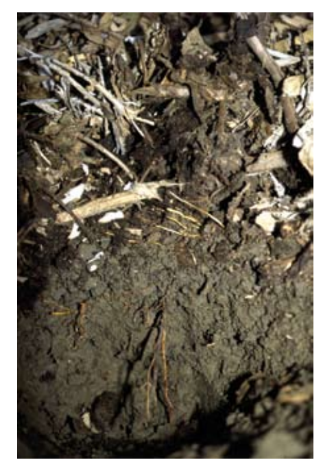
Figure 2. Avocado roots proliferate in the interface of mulch and soil. Old roots can be seen growing in lower soil layers, these roots are less vigorous and more susceptible to avocado root rot than those growing in or near mulch layers.

ganic mulches still seem to stimulate growth increases (Foshee et. al., 1999), again suggesting that nutrient additions are less important to growth response than other possible mulch benefits. While Faber et al. (2000) found that nutrients accumulated in