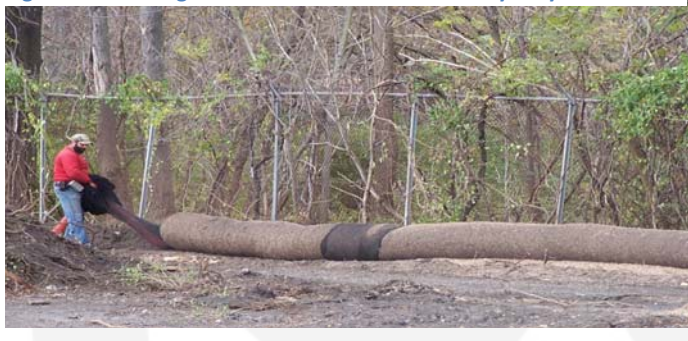
Figure 7. Installing a 24" Filtrexx SiltSoxx.

Researchers from Filtrexx International, a leader in developing compost-based stormwater water practices, and the independent Soil Control Lab, found that based on 45 tests of compost filter media the mean total solids removal was 92%, mean suspended solids removal was 30%, mean turbidity reduction was 24%, and mean motor oil removal rate was 89% (Faucette et al, 2006b). Moreover, the researchers found that by adding polymers to the filter media, removal efficiencies could be improved, sometimes dramatically. For example, turbidity reduction was increased from 21% to more that 77%, and soluble phosphorous removal increased from 6% to a remarkable 93%.