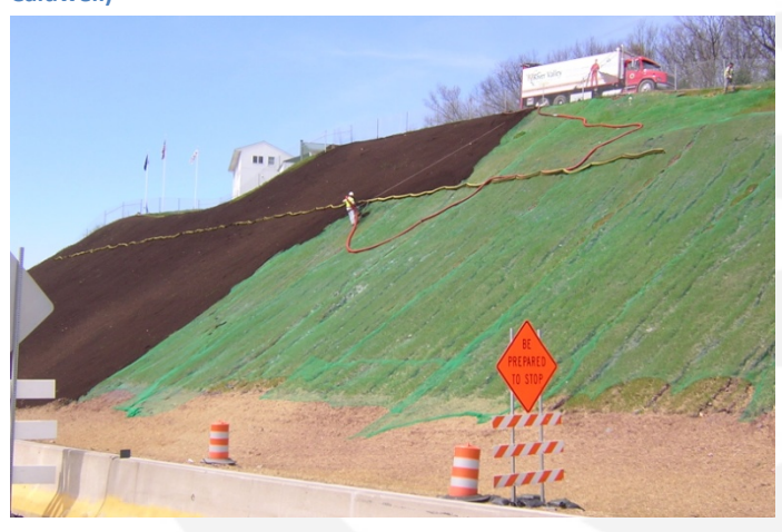
Figure 6. Applying a compost blanket in PA

Many studies have shown that compost can be highly effective for reducing and preventing erosion on an exposed slope.<sup>5</sup> Unlike most other stormwater BMPs compost has significant water holding capacity, so that low-to-medium intensity and duration rain events may produce no runoff at all (Persyn et al, 2004). Those that do produce runoff produce less, take longer before runoff starts and longer to reach peak flow (Glanville et al, 2003). Using compost of low nutrient value has the added benefit of releasing less phosphorous and nitrogen