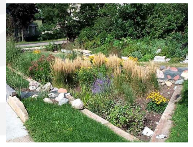
Figure 3. A rain garden in Maplewood, MN