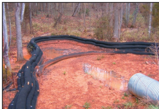
Use at Basin Outfall.