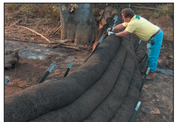
Stacking Method for Sediment Traps.